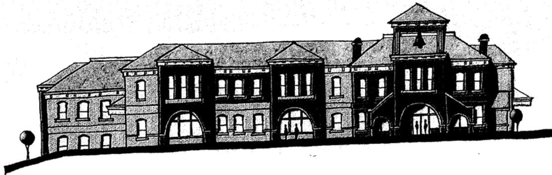
Front Elevation not to scale