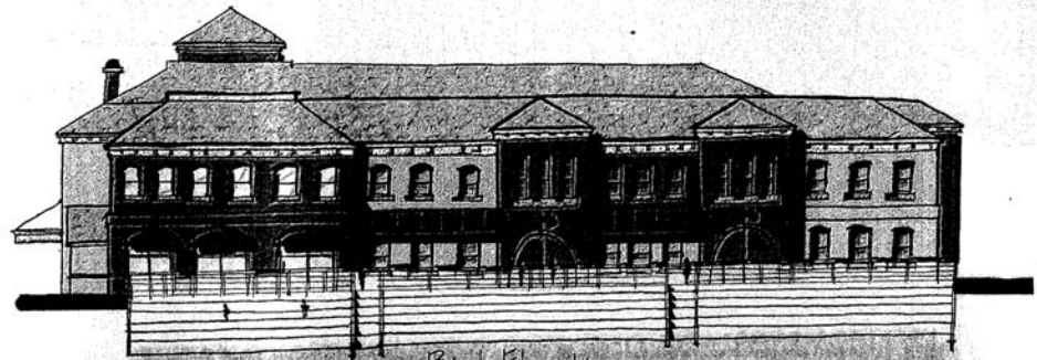
Back Elevation not to scale